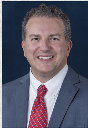
Jimmy Patronis Florida Chief Financial Officer