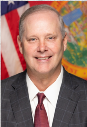
Wilton Simpson Commissioner of Agriculture